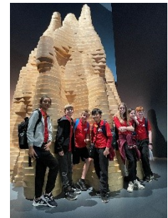
National Museum, giant termite nest model

some inventions from the past like the windmill. We also saw some ancient artifacts and Aboriginal artifacts. At the museum, we also learned about giant termite nests and there was a giant one that showed you what the inside of a nest looks like with lots of information about termites. After the National Museum, we went shopping to get some food for breakfast, lunch and snacks, then we went back to the hotel and set up our rooms. In the evening we did some training for the competition and had pizza for dinner.