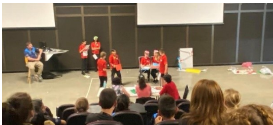
On the stage for the final presentation

After the presentations, we had some entertainment before the closing ceremony in the evening. There was some dancing, snakes that we could hold and even a magician doing magic tricks.