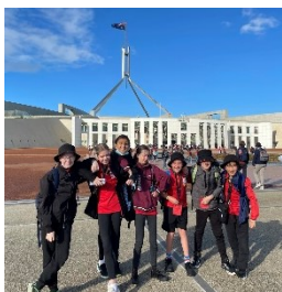
Outside Parliament House

On Friday we had to get up early again. We went to Parliament House on the bus for the TOM Opening Ceremony . At Parliament House we went into the Great Hall. We traded badges with kids from other teams so we would have TOM badges from other states in Australia and from New Zealand. At the Opening Ceremony, all the teams did their state chants. We had to make one up because we didn't know we needed one! One of the speakers at the Opening Ceremony talked about satellites and lasers that can shoot space junk to help clean up space.