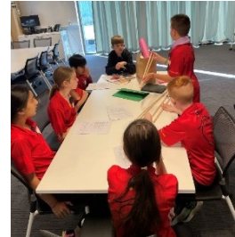
Brainstorming ideas for the challenge at the start of the 3 hour lockdown!

After our challenge we had some lunch, then we watched the other STEM team performances and then we gave our performance. When we got on the stage, we felt really nervous. We had few jokes